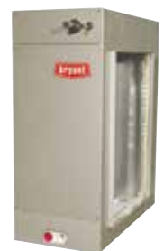
Model CSPHP Horizontal Cased Slab Coil