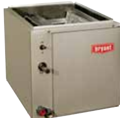
Model CNPVP/T Vertical Cased N-Coil Transition Width