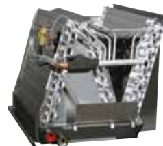
Model CNPVU Vertical Uncased N-Coil