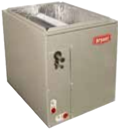
Model CAPMP Multi-Poise Cased A-Coil