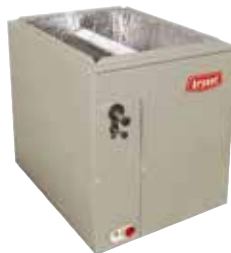
Model CAPVP Vertical Cased A-Coil