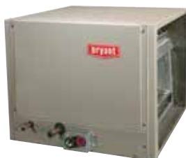
Model CNPHP Horizontal Cased N-Coil