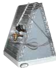
Model CAPVU Vertical Uncased A-Coil